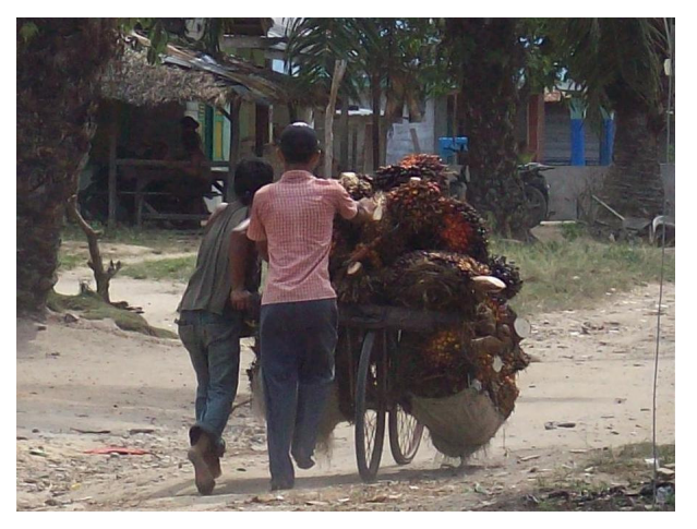
Transport of FFBs to the mill

fields to oil palm plantations. In addition, the increase in fertilizer price and labour wage also pushed farmers to convert their paddy fields into oil palm plantation. On average, farmers only need to fertilize oil palm trees twice a year. Labour is needed for fertilisation and harvesting, which is done twice a month. With such patterns, farmers consider that running oil palm plantation will give higher benefit than paddy.